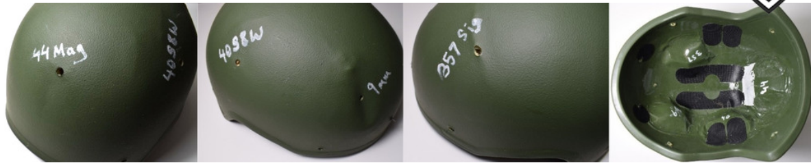
Ballistic helmet test against .44 magnum, .357 SIG, 9mm and 40 S&W.